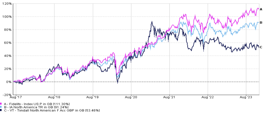
VT Tyndall North American Fund F Acc v Fidelity Index US & IA NA Sector Since launch