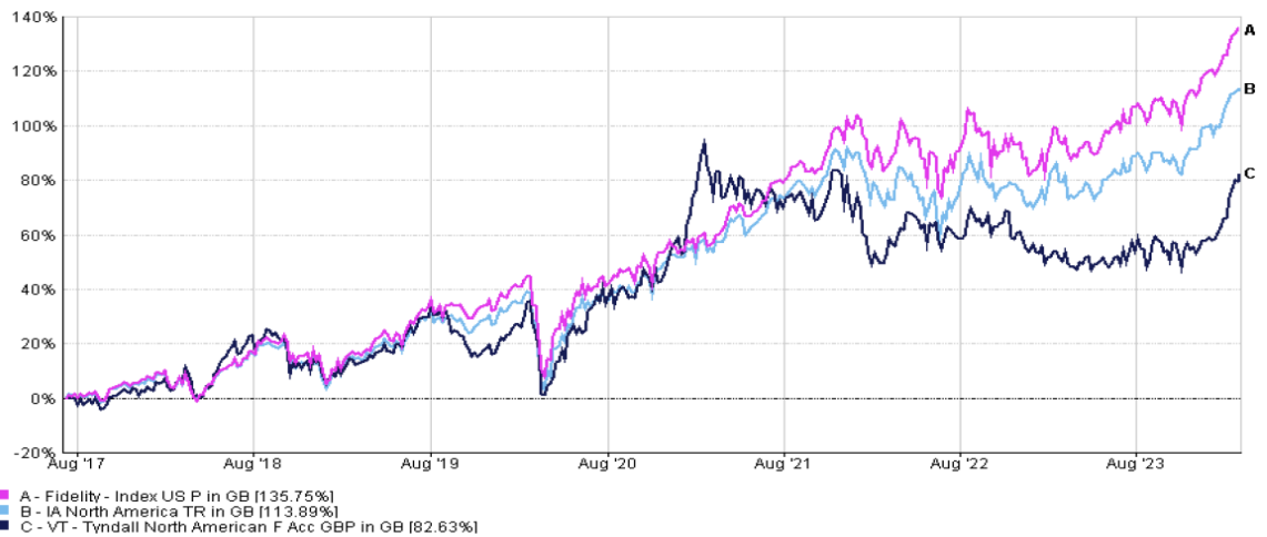
VT Tyndall North American Fund F Acc v Fidelity Index US & IA NA Sector Since launch